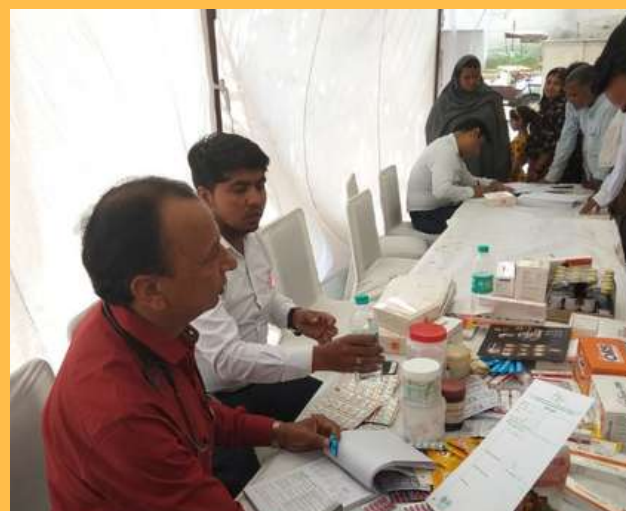
INCREASED ACSES TO HEALTH.