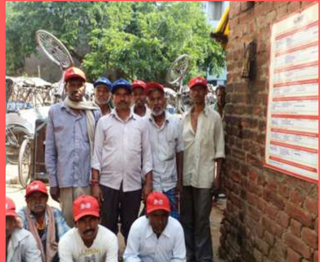
INCREASED AWARENESS & ACCESS TO HEALTH, LEGAL & FINANCIAL SERVICES

The interventions have given impetus to need and subsequently demand generation on part of the RPs to avail services and products to lead a better way of life and they are willing to be able to fulfil this need by themselves only and through government schemes. Overall, it was also observed that a positive response was seen among the rickshaw pullers and also change in behaviour was observed towards their health, hygiene, living conditions.