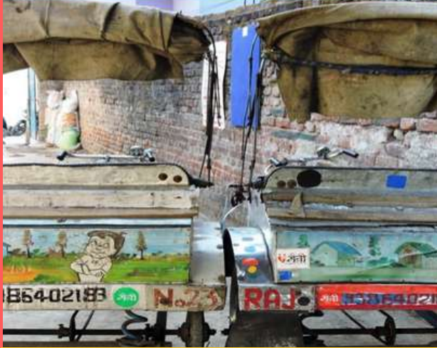
INCREASED ACCESS & ASSERTION OF RPs

Maitri is collaborating with organisations like UCMACS (for donation of books and clothes), ASHA, Jharkhand (for free residential education to RPs children) to extend the services to the RPs' families as well. Subject matter experts from organizations like Forum to Engage Men (FEM), Centre for Health & Social Justice (CHSJ), JUMAV MANCH, SPARK, have shown interest in imparting gender sensitising training to the RPs in field,