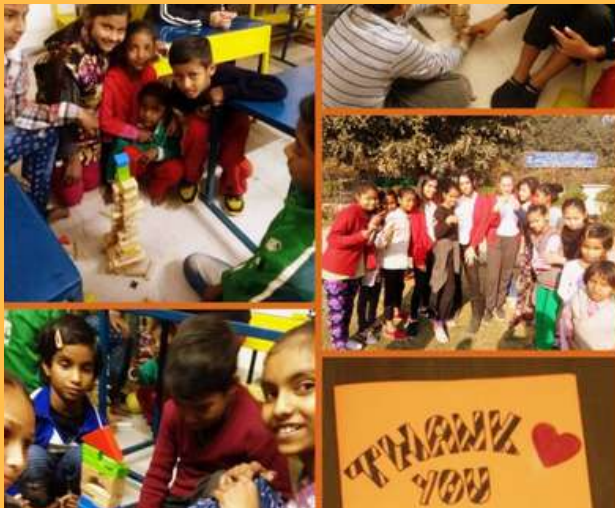
INCREASED EXPOSURE, PARTICIPATION AND CONFIDENCE.

Children have participated in all celebrations and functions like teacher's day, Independence Day, friendship Day etc. They also actively participate in creative workshops organised by different schools.