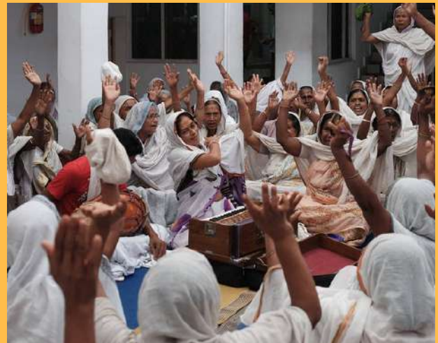
IMPROVEMENT IN ACTIVITY, PARTICIPATION & MENTAL HEALTH.

With access to activities, the widows are able to form stronger bonds with those around them and experience lower feelings of isolation, loneliness and depression; their overall sense of wellbeing, self worth and belonging improves. This helps in promoting stronger social bonds, participation and solidarity among widow mothers.