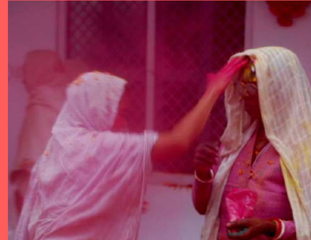
IMPROVEMENT IN MOBILITY, PARTICIPATION, & SOCIAL BONDS

Most of the widow mothers have lived in harsh conditions, poverty and neglect throughout their lives, which has direct bearing on their health. From poor eyesight to bad stomach ulcer, diabetes to paralytic stroke, they face a range of health problems. Maitri's timely intervention helps their health condition from deteriorating. Health is a priority service provided by Maitri.