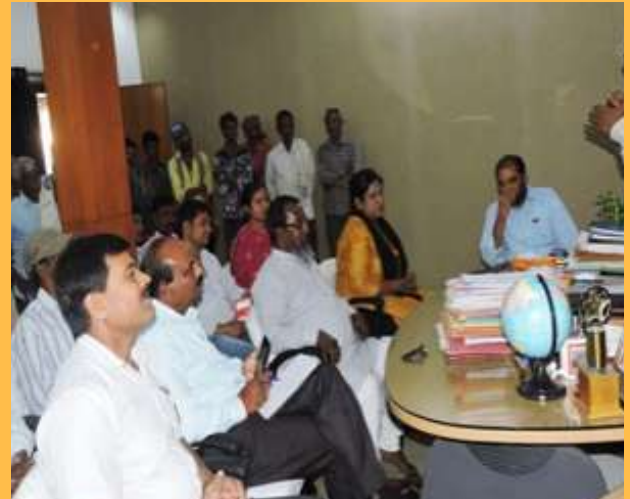
IMPROVEMENT & INVOLVEMENT OF STAKEHOLDERS