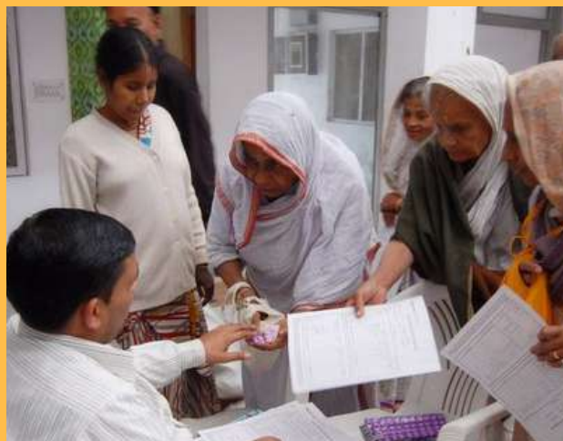
IMPROVEMENT IN HEALTH

Most of the widow mothers have lived in harsh conditions, poverty and neglect throughout their lives, which has direct bearing on their health. From poor eyesight to bad stomach ulcer, diabetes to paralytic stroke, they face a range of health problems. Maitri's timely intervention helps their health condition from deteriorating. Health is a priority service provided by Maitri.