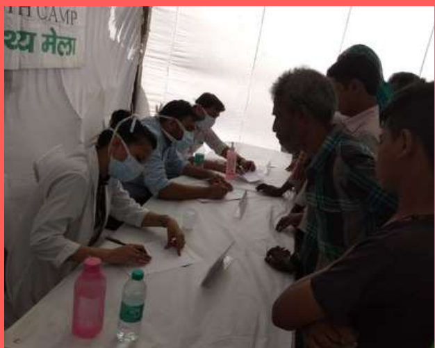
INCREASED AWARENESS & CHANGE OF ATTITUDE

Non-traditional outlets of condoms such as a paan store or a general store has encouraged more number of migrant workers to access condoms. Altogether 54 non- Traditional condom Outlet have been established.1260 condom demonstration session have been conducted through various activities to teach the community about correct usage of condom.