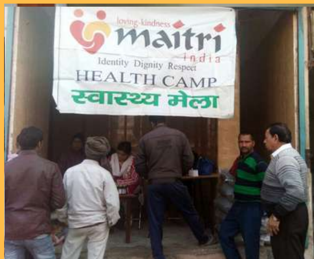
INCREASED ACCESIBILITY TO SERVICES