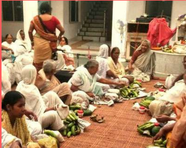
IMPROVEMENT IN LIVING CONDITIONS, HEALTH, NUTRITION & OVERALL WELLBEING.

As a result of clean and spacious Home that welcomes destitute widows where they are looked after as mothers and provided with meals, clothing and healthcare, the project has successfully uplifted and transformed lives of more than 300 widow mothers. Having all documentations and identification, helps them achieve citizenship rights. It also promotes a sense of identity and self-confidence.