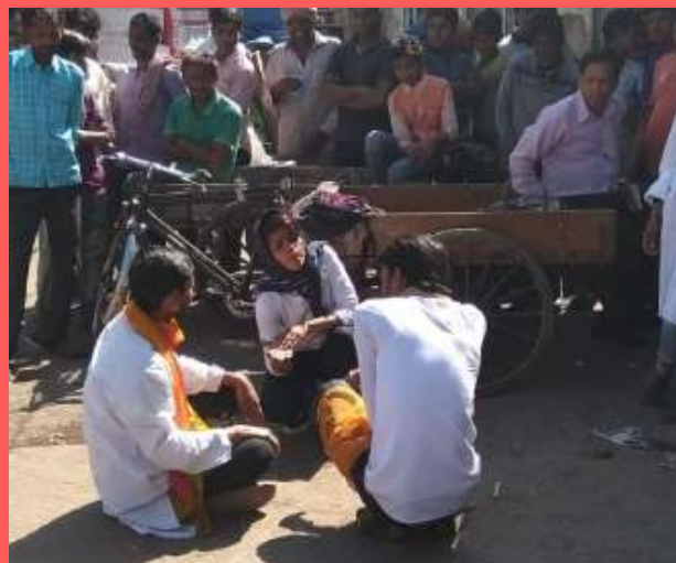
INCREASED COMMUNITY PARTICIPATION

Regular health camps conducted by the Project in target communities have enabled more number of individuals to access healthcare services including HIV testing, right at their door step. Everyday is a big challenge for Migrant workers who barely make it through the day. When the priority is to work hard just to get two square meals, their health and wellness takes a backseat.