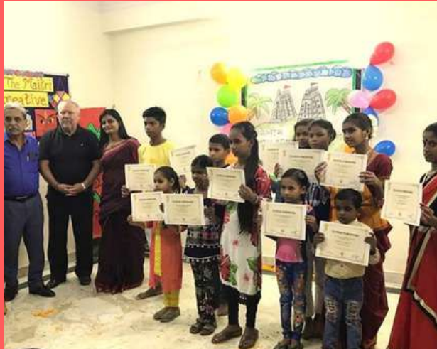
IMPROVEMENT IN ACADEMIC PERFORMANCE.

Maitri keeps a track on the academic performance of individual students. Helping every student at individual level has helped. It has dramatically increased the level of interest among the students and also improved their academic performance. Moreover 12 students were awarded scholarships based on their outstanding performance in school.