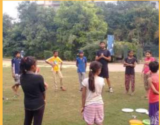
IMPROVEMENT IN ACTIVITIES.

Champs even won an award for being the Most Spirited team of the championship.